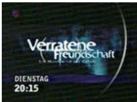
Picture 4: SAT.1, 2000: Trailer «Verratene Freundschaft» (betrayed friendship)