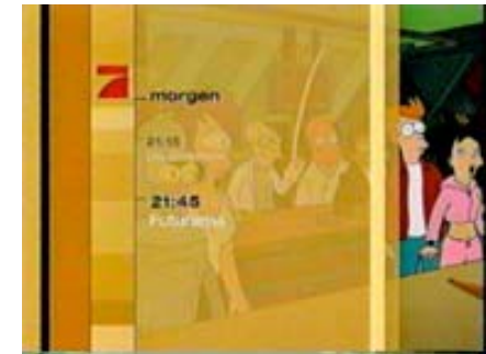
Picture 5a, b, c, d: Pro7, 2001: Trailer «Die Simpsons and Futurama»