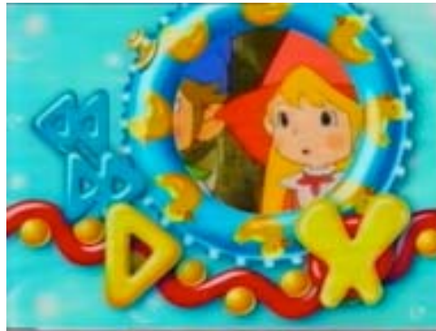
Picture 6a: Fox Kids, 2001: Trailer Die kleinen Zwurze ( The little crumpled dwarfs )