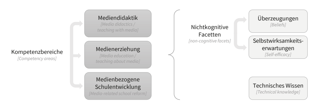
Fig. 3.: M³K Structural competency model of Medienpädagogische Kompetenz (Diagram adapted from Herzig et al., 2016, p. 11).

To summarize the findings regarding the overall model structure, DigComp-Edu has been allocated to the group of competency development models; TPACK clearly is a structural competency model; and M³K has been interpreted to belong to this category as well even though it represents a more complex level-oriented approach in comparison to TPACK regarding the standards included. Yet it has been defined as a structural competency model because of the focus on the relationship between the competency fields and areas and because there are no competency levels quantifying the proficiency or degree of competency of a person. However, there are hierarchical structures within the M³K competency aspects and in the standard descriptions based on Bloom's taxonomy, which is a common feature for competency level models. Hence, M³K unites characteristics of both approaches. To conclude, this structural analysis of the three models confirms that the distinction between structural competency models and competency level or development models is not fully selective.